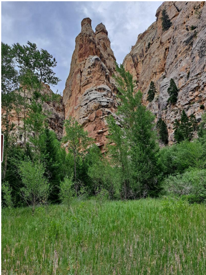
"The Tower, Sheep Creek Geologic Loop"

We drove the Geological loop. The rock formations that mother time has carved out of the rocks were amazing. There were many areas where you could see the many layers formed over thousands of years. Overall, it made for an interesting sight seeing trip.